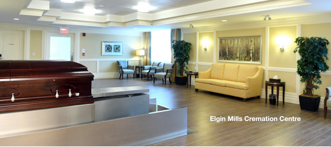
Elgin Mills Cremation Centre