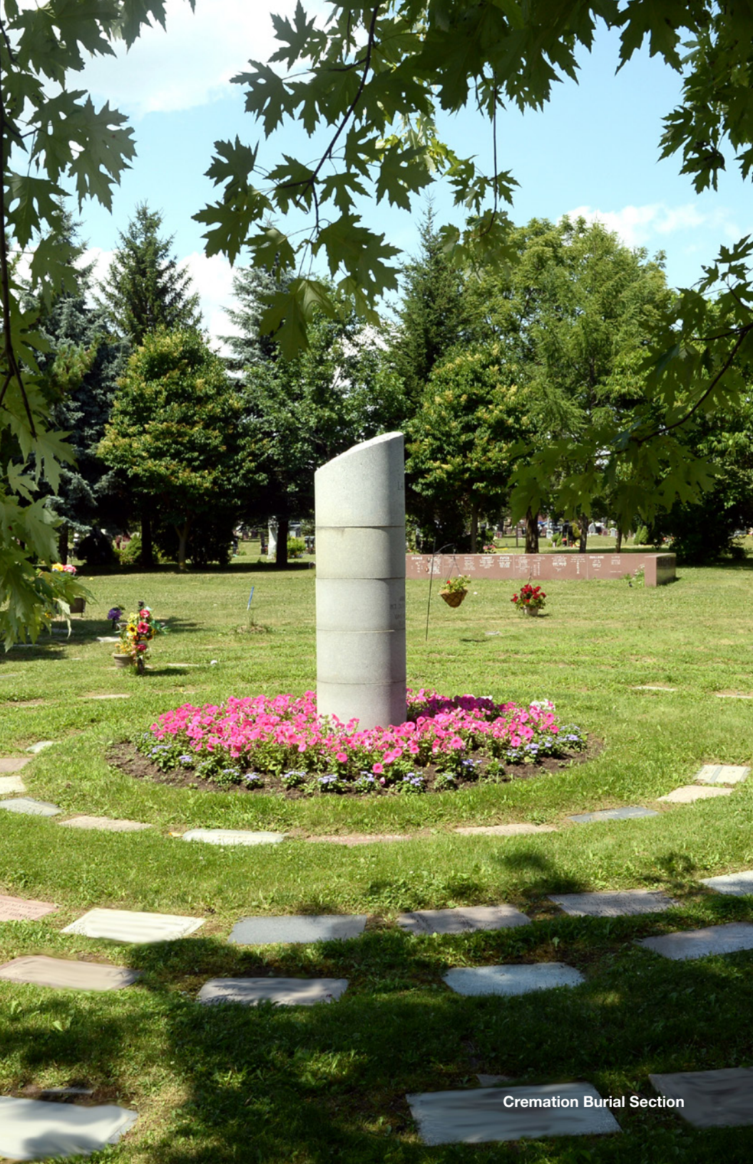
Cremation Burial Section