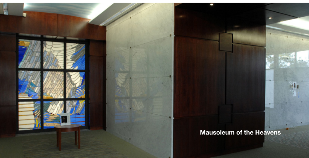
Mausoleum of the Heavens