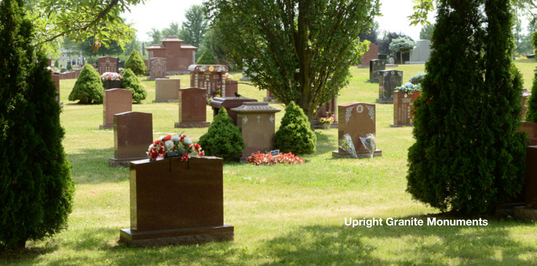
Upright Granite Monuments