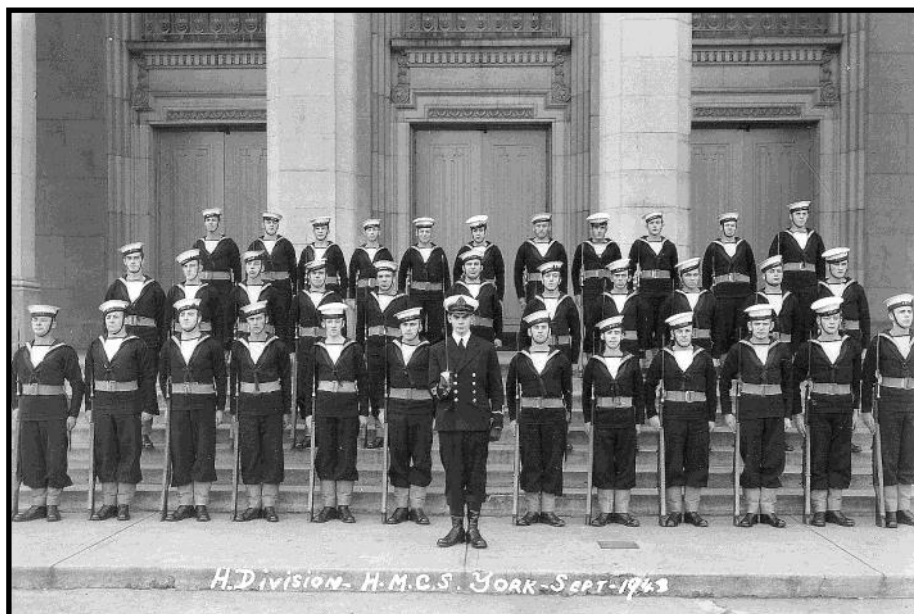
Members of H.M.C.S. YORK, Naval Reserve Division, Toronto. Sept. 1943