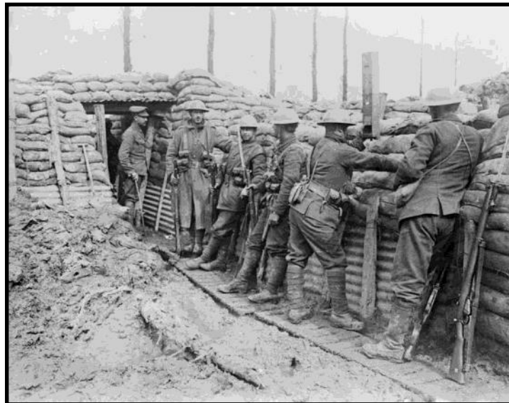
1st Canadian Division. Ploegsteert, Belgium, 29th March 1916