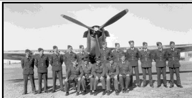
RCAF Pilots at Torbay, Newfoundland, 1942