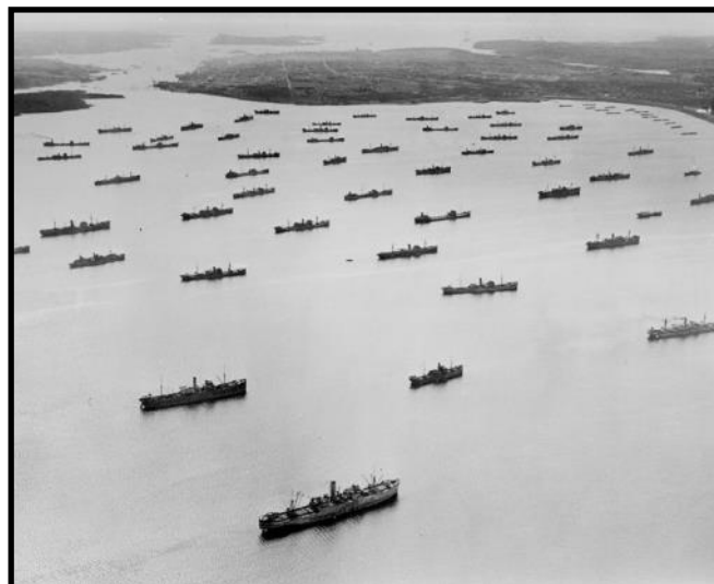
Bedford Basin, upper end of Halifax Harbor, 1942