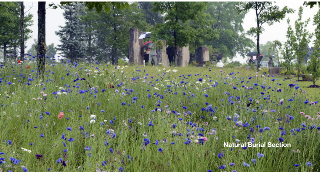
Natural Burial Section