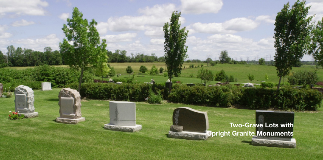
Two-Grave Lots with Upright Granite Monuments