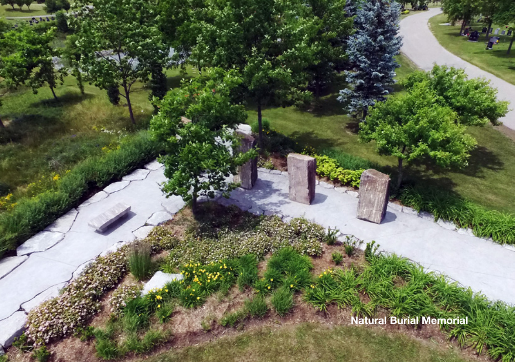
Natural Burial Memorial