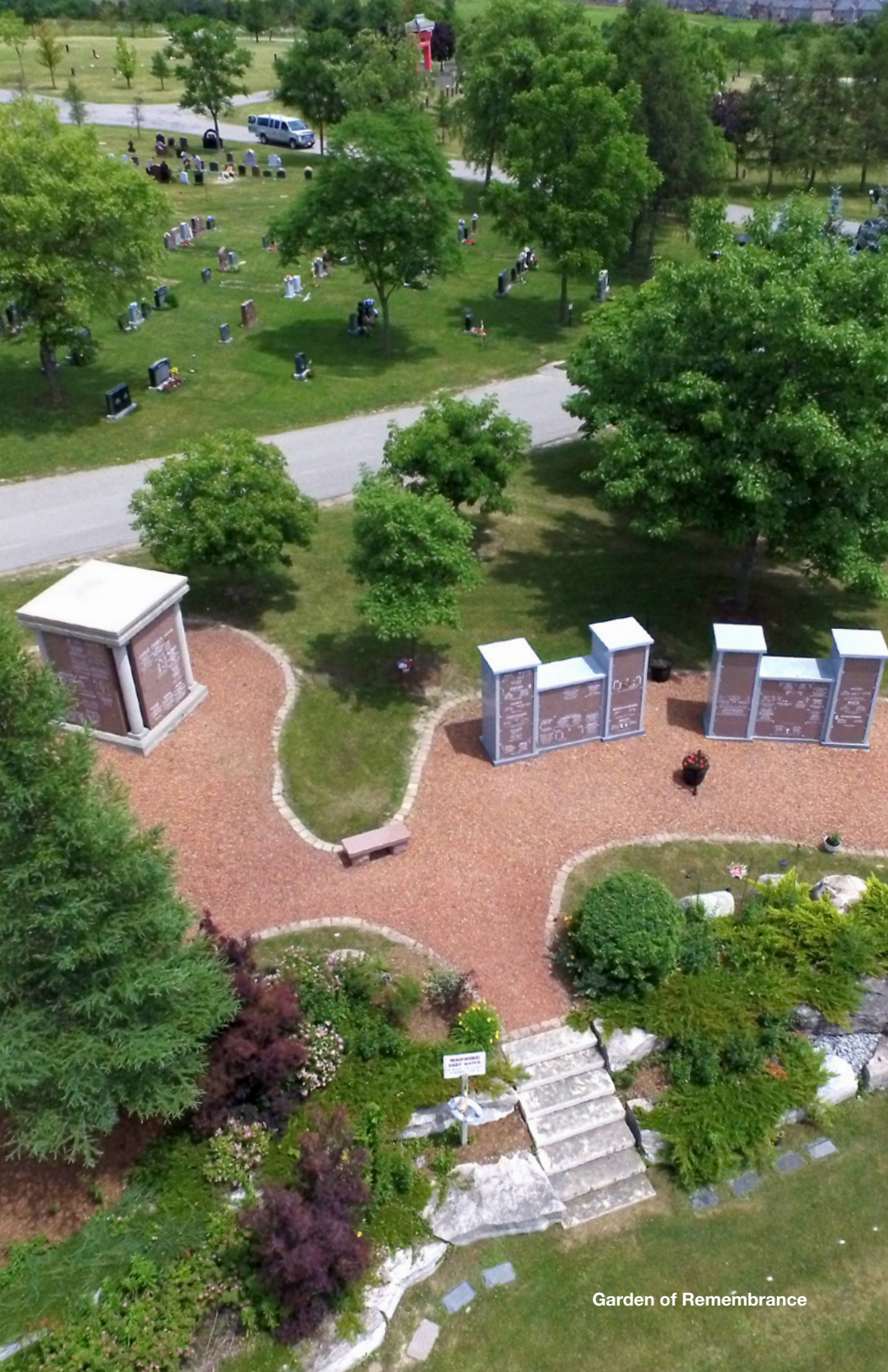
Garden of Remembrance