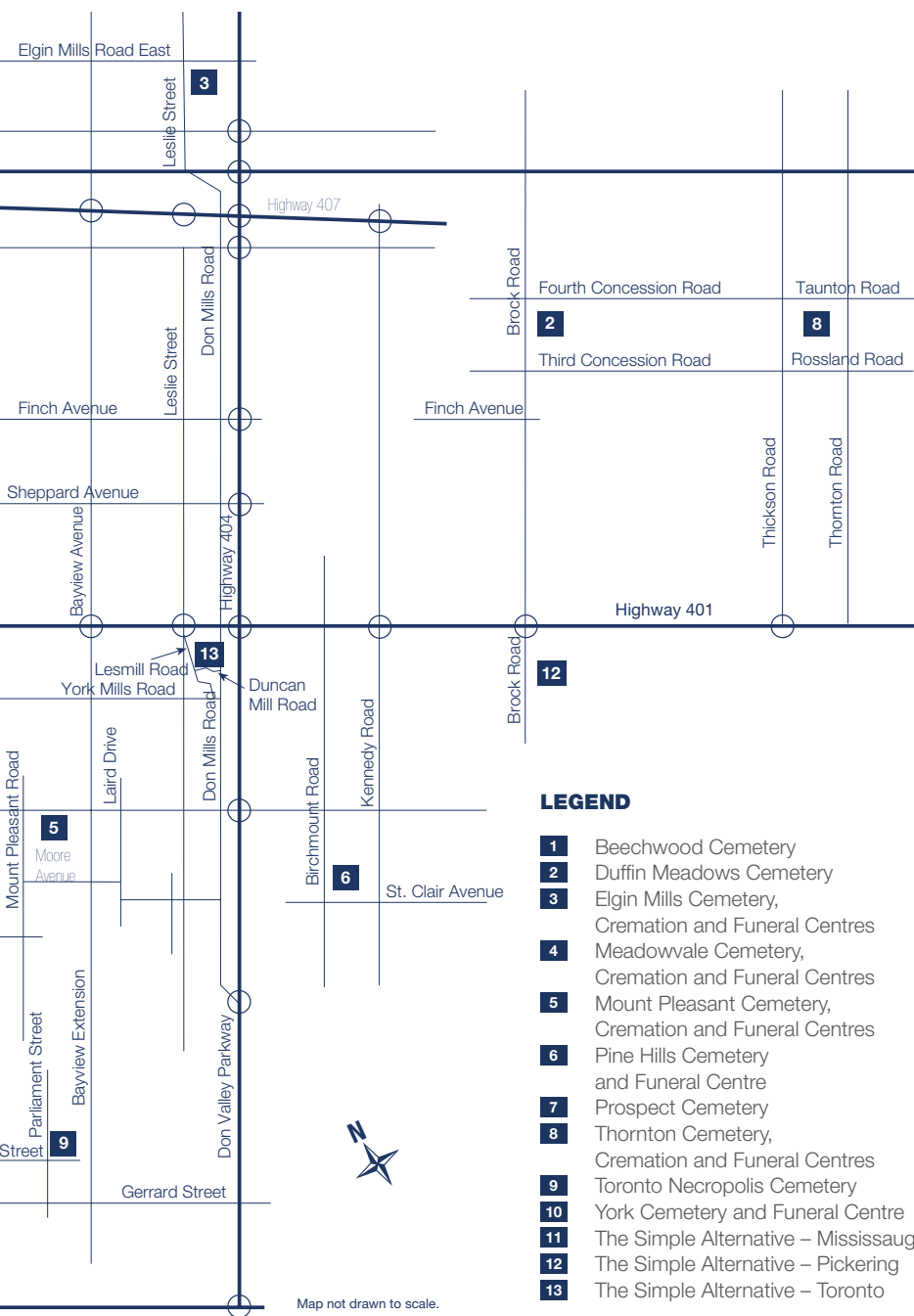
Map not drawn to scale.