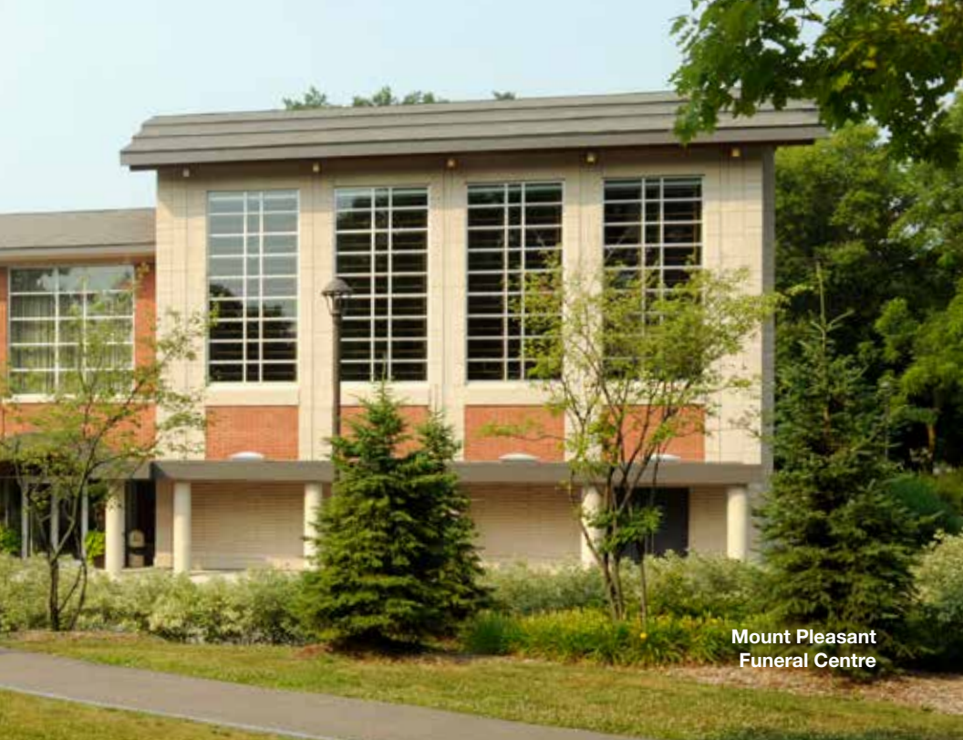
Mount Pleasant Funeral Centre