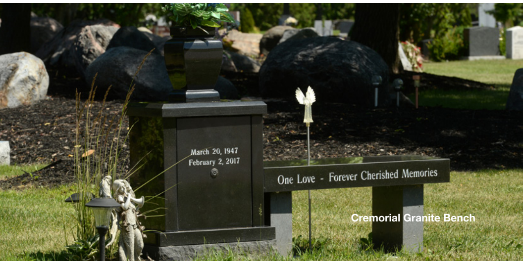
Cremorial Granite Bench