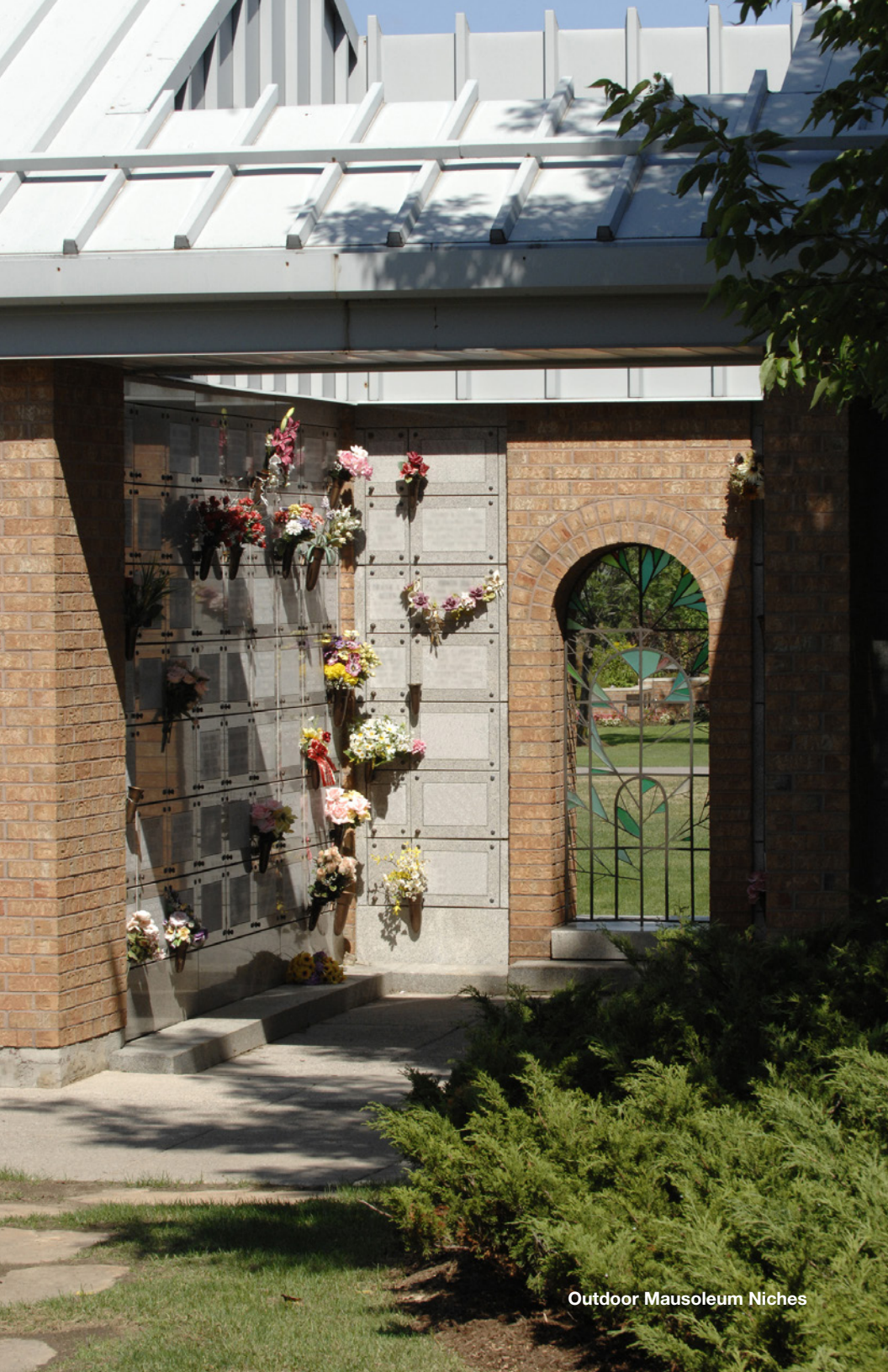
Outdoor Mausoleum Niches