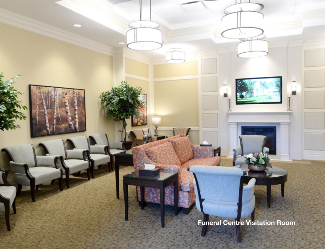
Funeral Centre Visitation Room