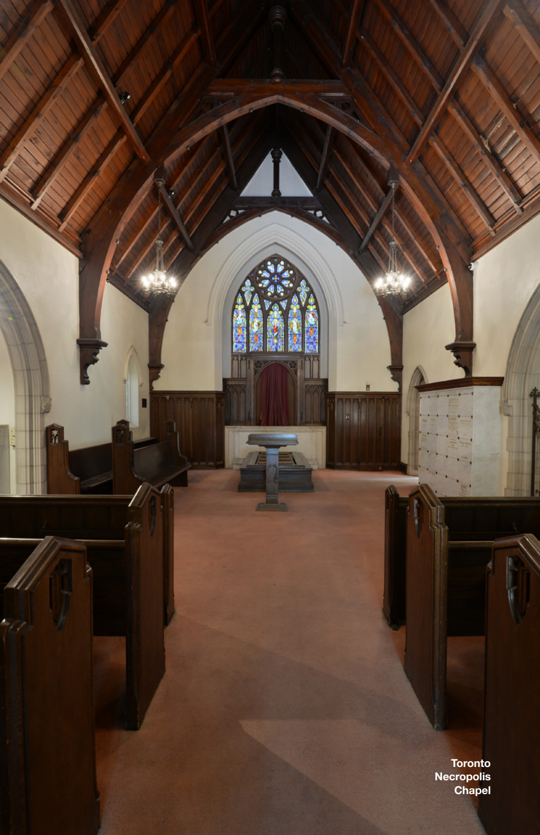
Toronto Necropolis Chapel