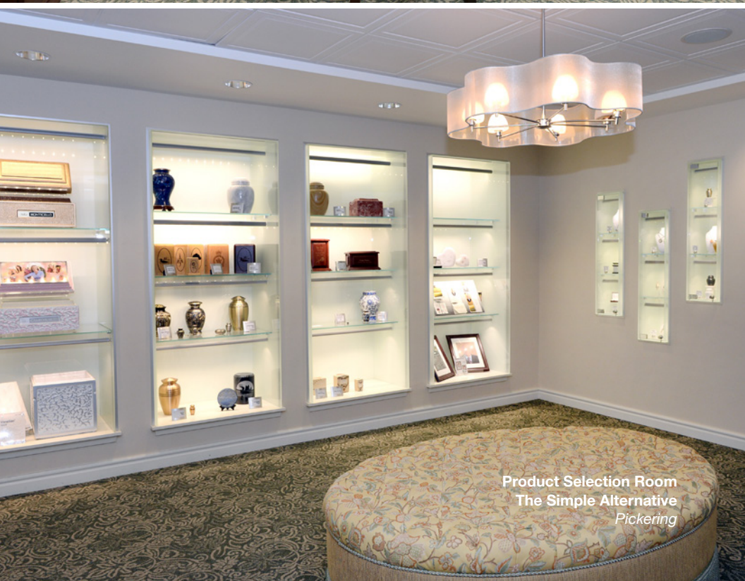
Product Selection Room The Simple Alternative Pickering