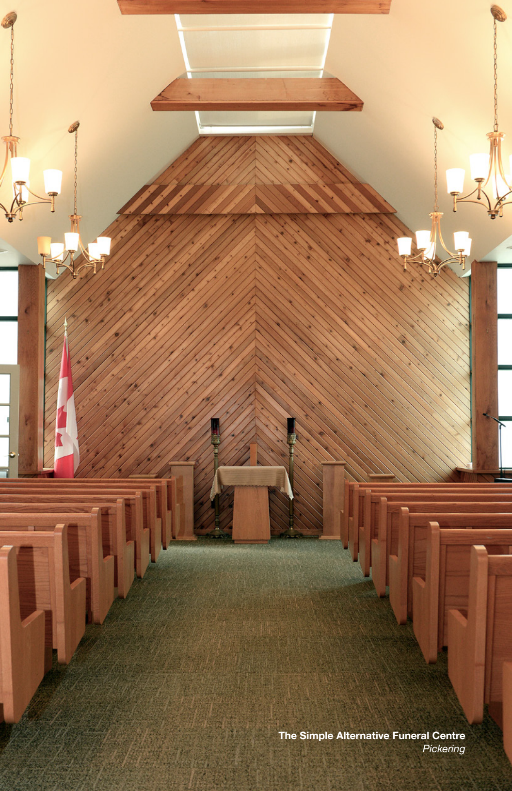
The Simple Alternative Funeral Centre Pickering