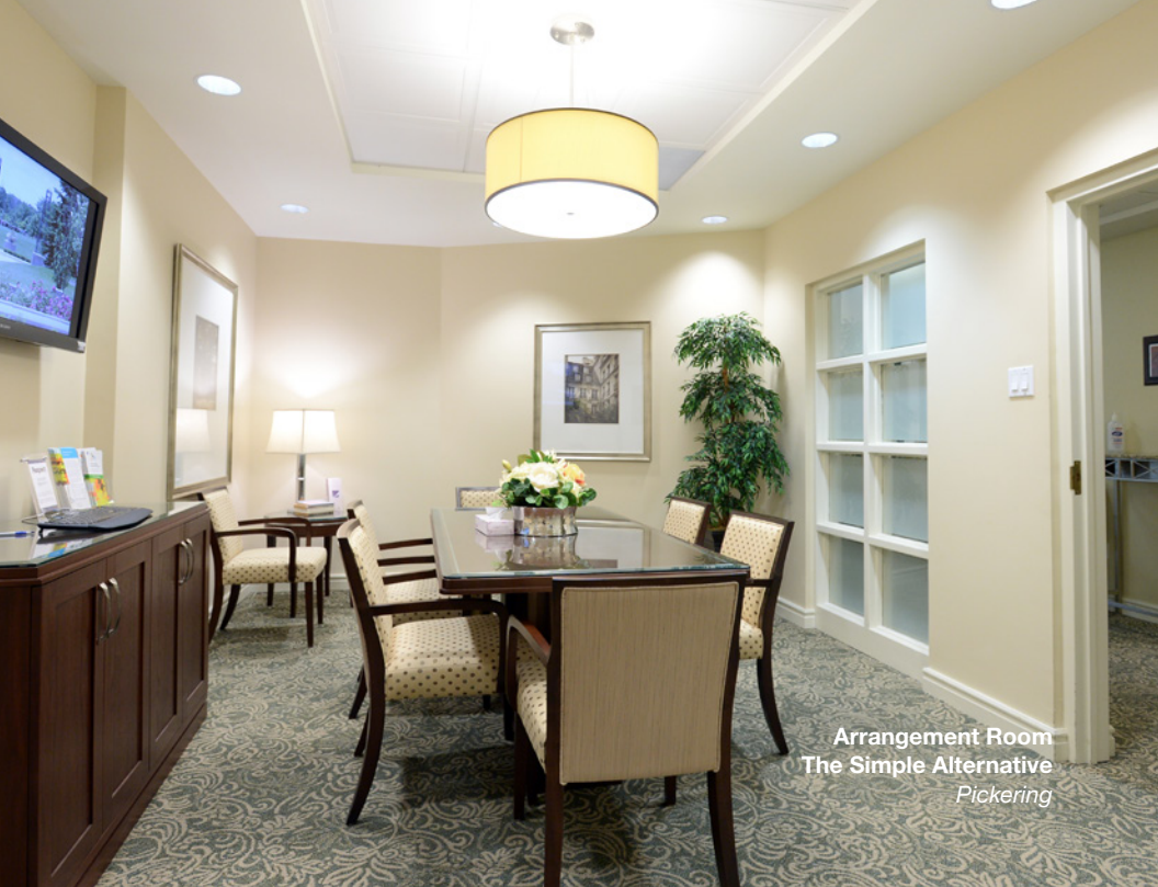
Arrangement Room The Simple Alternative Pickering