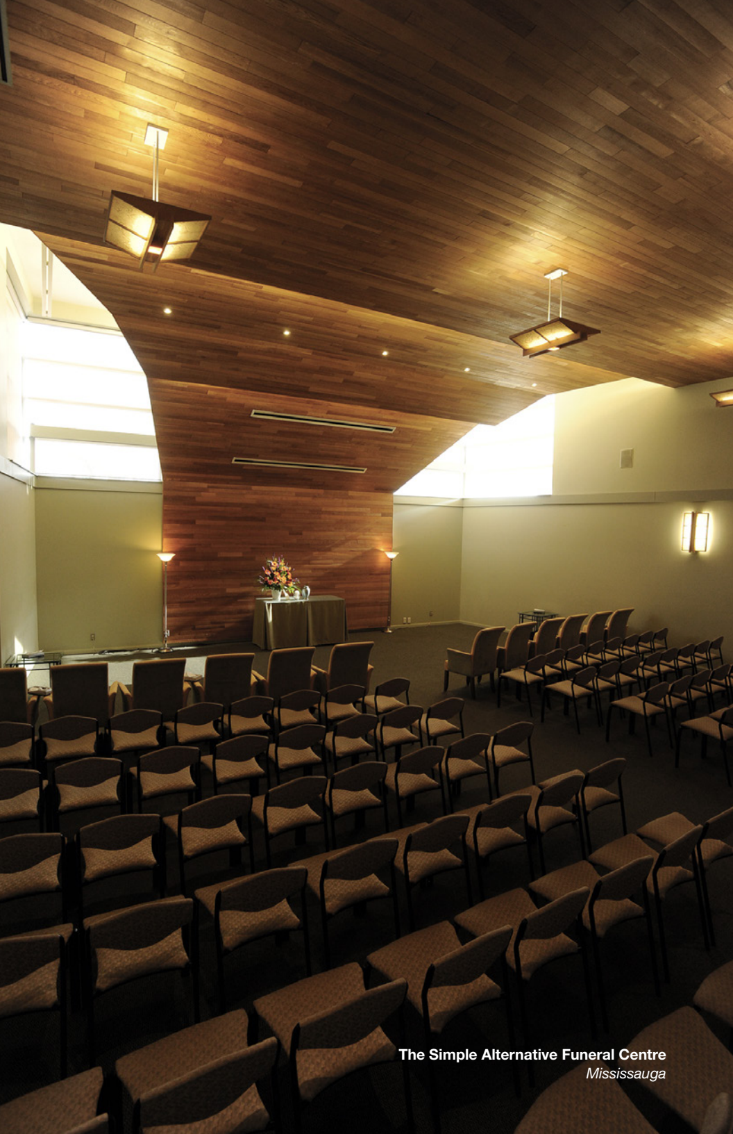
The Simple Alternative Funeral Centre Mississauga