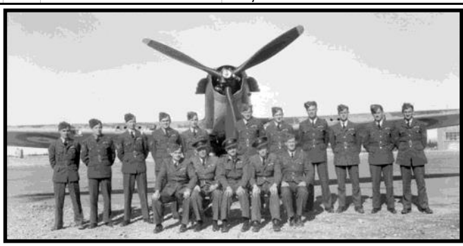
RCAF Pilots at Torbay, Newfoundland, 1942