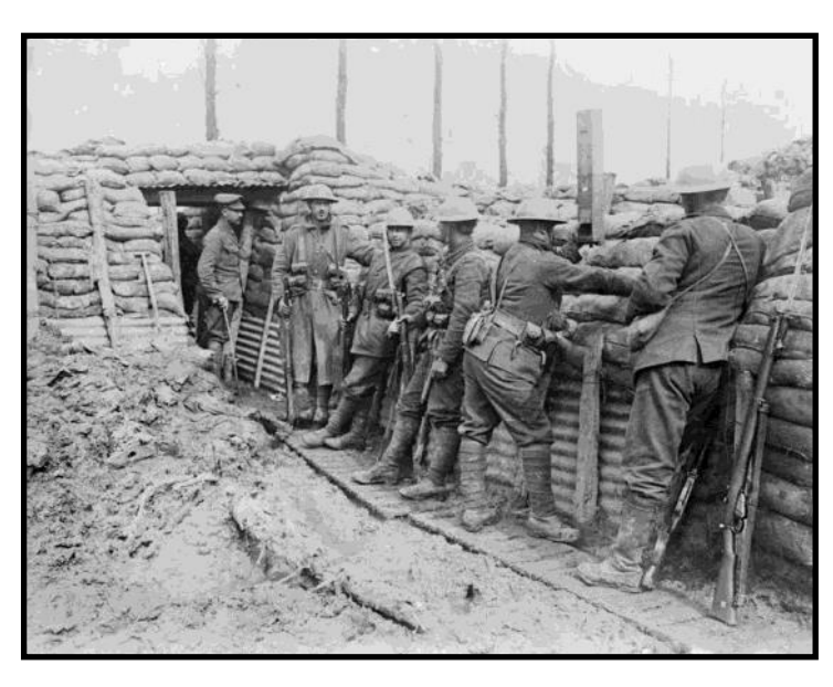
1st Canadian Division. Ploegsteert, Belgium, 29th March 1916