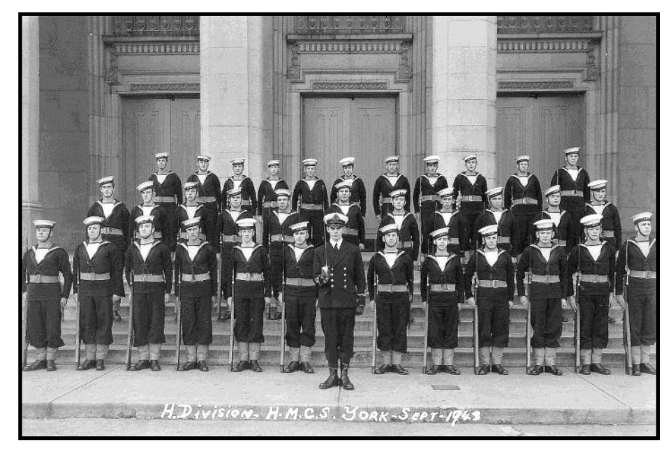
Members of H.M.C.S. YORK, Naval Reserve Division, Toronto. Sept. 1943