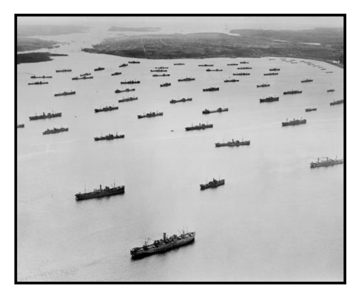
Bedford Basin, upper end of Halifax Harbor, 1942